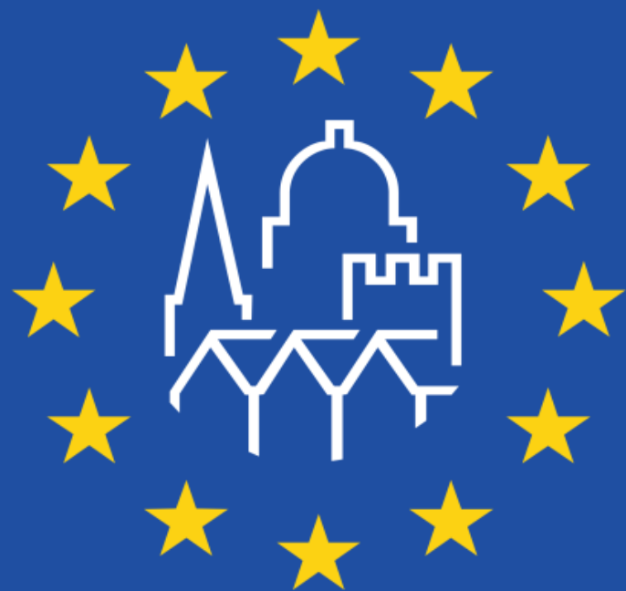
Meeting with EHDs NC 27 June 2017, Brussels